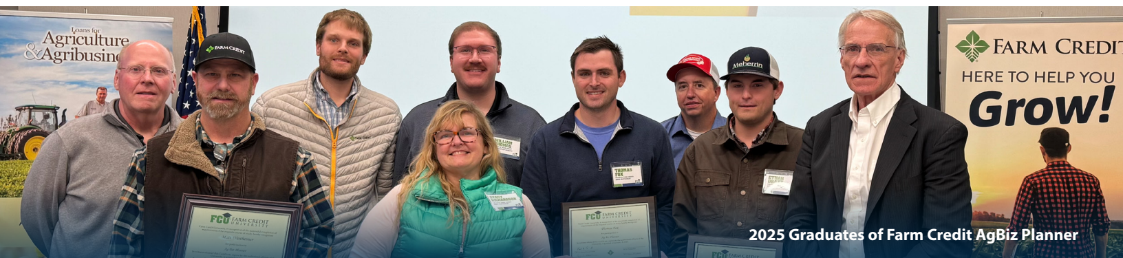
2025 Graduates of Farm Credit AgBiz Planner