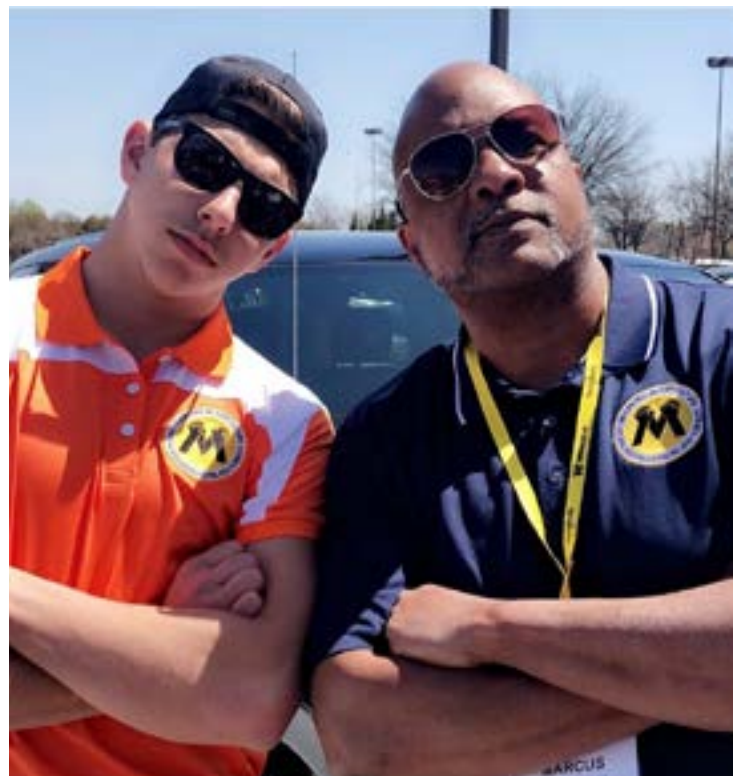
Me and my MANRRS advisor at the conference in Pittsburg