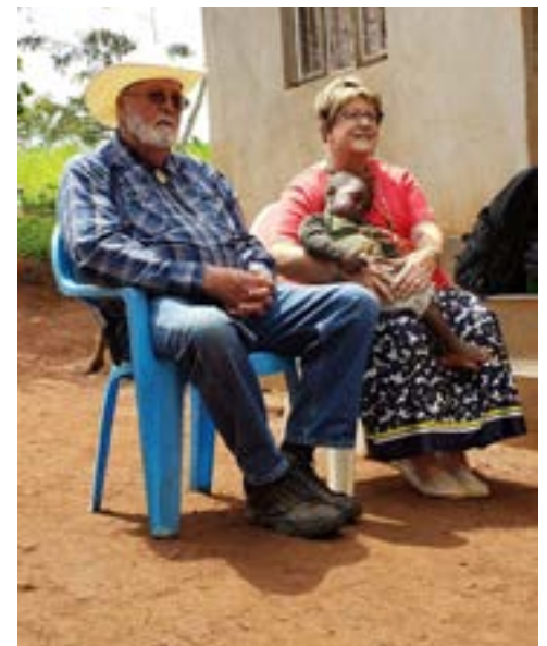
The Blake's with a sick child