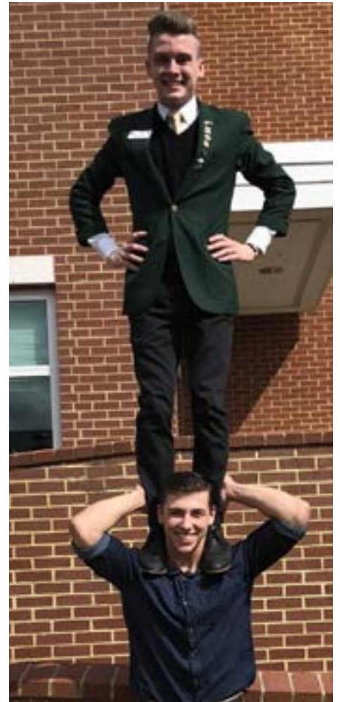
The day my buddy and I found out the VSU 4-H Club got approved

Not only has Farm Credit and the Colonial Agricultural Educational Foundation helped me in my educational endeavors, I was also hired as a loan officer in the Windsor office of Colonial Farm Credit in 2019. I am very fortunate to have been welcomed into the Farm Credit family, who prides itself on servicing agricultural and rural communities, and I look forward to seeing where my career with the Association takes me! ■