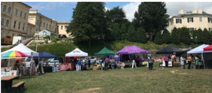
On the Square VA Farmers' Market at Capitol Square in Richmond, VA is very popular amongst the downtown crowd for stocking up on fresh produce for the weekend.

Colonial Farm Credit continues to sponsor farmers' markets throughout the territory. Support comes in the form of signs and banners, reusable and compostable bags, and monetary donations to help market specific initiatives. Many markets run through the fall so be sure to support your local markets for the remainder of the season! For a listing of markets in your area, visit the farmers' market pages of www.vdacs.virginia.gov or http://mda.maryland.gov . ■