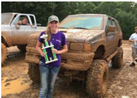
Mud bog at the Fredericksburg County Fair