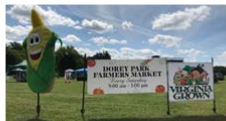
Dorey Park Farmers' Market is new to the market scene this year. Colonial Farm Credit sponsors the Power of Produce program, whose purpose is to educate kids on the importance of fresh fruits and vegetables.