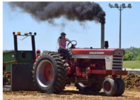
Tractor pull at the Isle of Wight County Fair