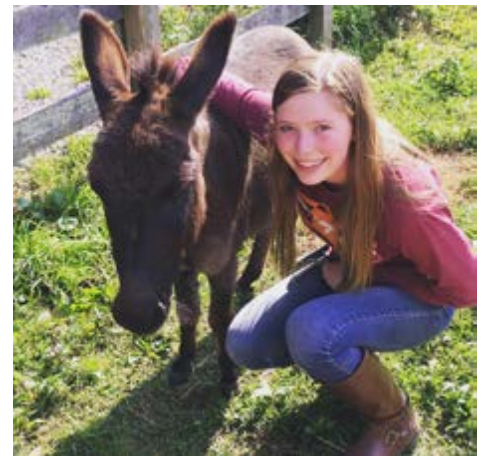
Taking care of miniature donkeys with the Equestrian Club at Virginia Tech tractor pull at the Isle of Wight County Fair