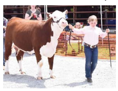
Piedmont Livestock show

Spring was Jr. Livestock Show time across Virginia! Youth of all ages competed in these day long events, exhibiting their lamb, beef, swine, goat, and other projects. Colonial Farm Credit was a proud sponsor of many Jr. Livestock shows across the territory.