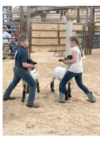
Central Virginia Livestock show