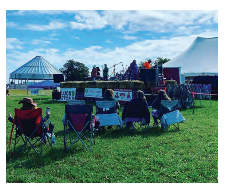
Colonial Farm Credit sponsored outdoor music at Hanover Vegetable Farm this fall.