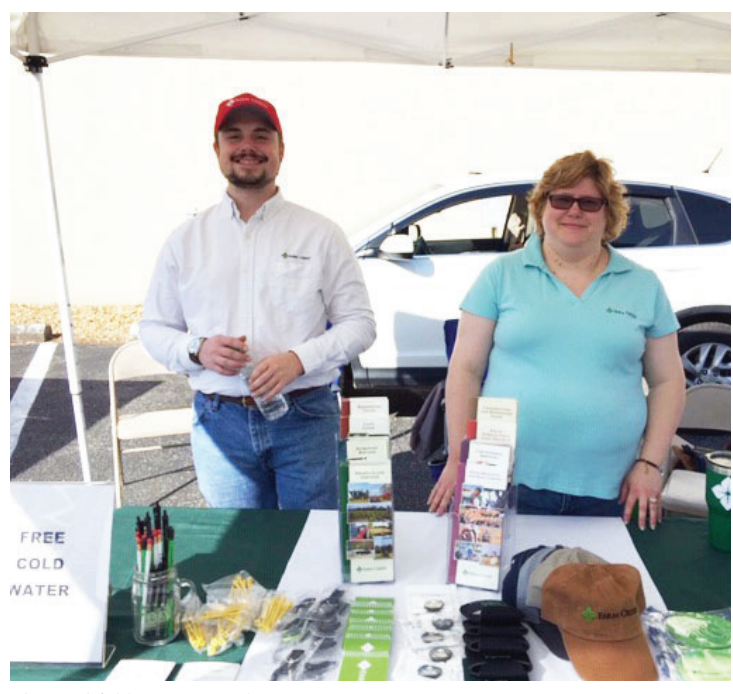
The Smithfield Farmers Market

Colonial Farm Credit is once again sponsoring various markets across the territory this year with recyclable and reusable bags and monetary donations. Market season is here, so don't forget to visit many in your area to support local business. Check out the recipe in this newsletter to use some of your fresh market finds!