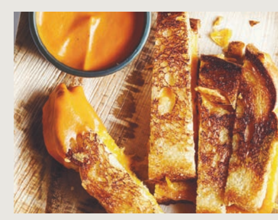
Recipes by Bon Appétit.

2. Heat a dry skillet, preferably cast-iron, over medium heat. Dividing evenly, spread room-temperature butter over bread slices. Top unbuttered side of 8 slices with cheddar, dividing evenly. Top with remaining bread, buttered side up, and cook, turning once, until bread is golden brown and cheese is melted, about 3 minutes per side. Cut sandwiches into soldiers and serve alongside hot soup for dipping.