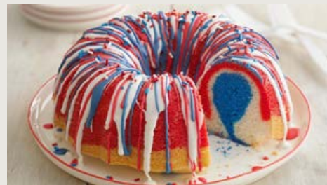
Recipes and photos courtesy of www.bettycrocker.com .

over cake. With spoon, drizzle all of white frosting back and forth around cake in a striping pattern. Repeat microwaving second bowl of frosting until smooth. Stir in a few drops blue food color until well blended. Drizzle over cake, scattering frosting back and forth. Repeat with remaining bowl of frosting and red food color, making sure red, white and blue frostings can be seen on cake. Let cake stand at room temperature until frosting is set before serving.