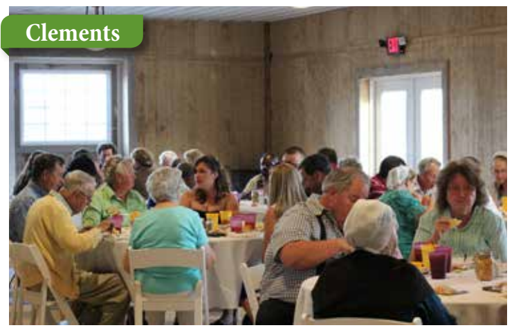
Customers enjoy a nice dinner at Belmont Farm in Maryland.