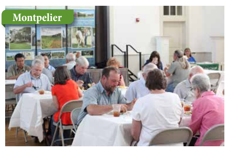
Good food and conversation were had by all at the Montpelier Center for the Arts and Education.