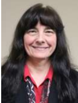
Lunenburg, Virginia President